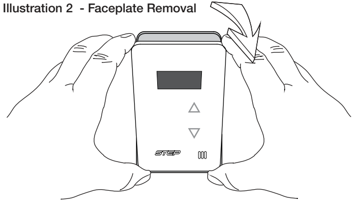
Illustration 2 - Faceplate Removal

This mode is enabled when the thermostat is being used with the snowmelt and deicing elements. The external temp sensor is installed in the concrete or on the roof and the Set Temperature is adjustable between 32°-41°F/0°-5°C. This value is maintained in flash memory. The display will show this measurement and, as with external mode, when both the UP/DOWN switches are pressed and released within 1 second, the display will show the ambient temperature for a short period after which it will revert to the external temperature sensor. When in Snowmelt mode, the snowflake logo on the front panel will glow blue.